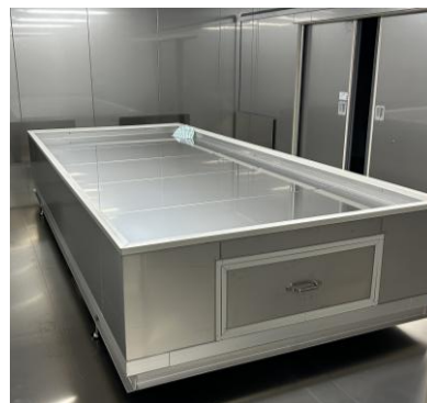
Stainless steel panel made Tana stand