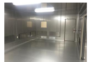
Panel heaters made in-house