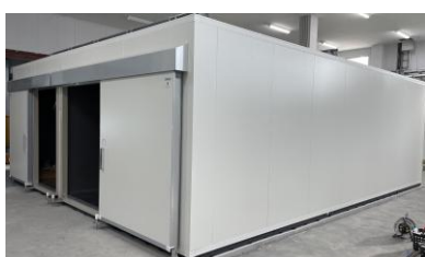
Economical color steel sheathing is also available