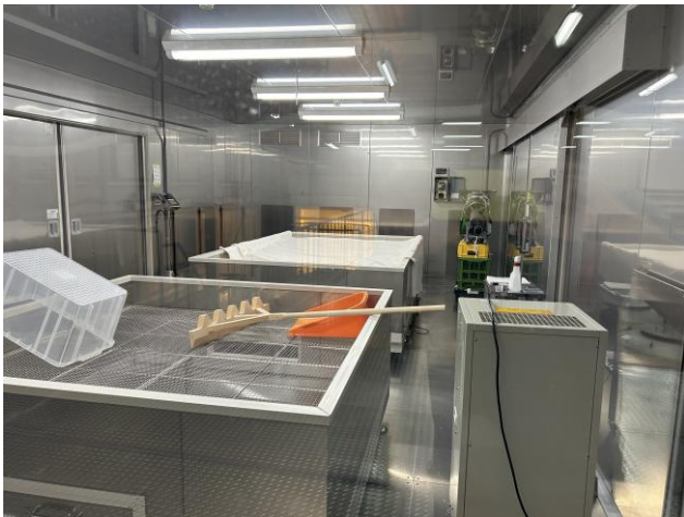
Example of using the Tana koji room

Louvers for quick heat dissipation, Viewing window with anti-condensation heater, Stainless steel panel made Toko stand, Tana stands that can be easily removed and washed to maintain cleanliness, Load Cells (Scales), Drying equipment when the koji is taken out, Dehumidifier dryer, etc., we will also propose peripheral facilities.