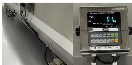
Load cells can measure up to 100 g